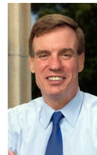
Mark Warner (D-VA)

Sens. Steve Daines (MT-R), John Cornyn (R-TX), and Amy Klobuchar (D-MN)